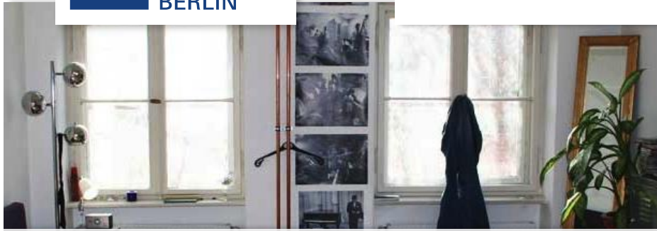
DAY SCHOOLS & HOST FAMILY